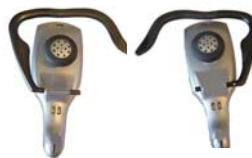
Figure 4. ezEarhook connected for right and left ears